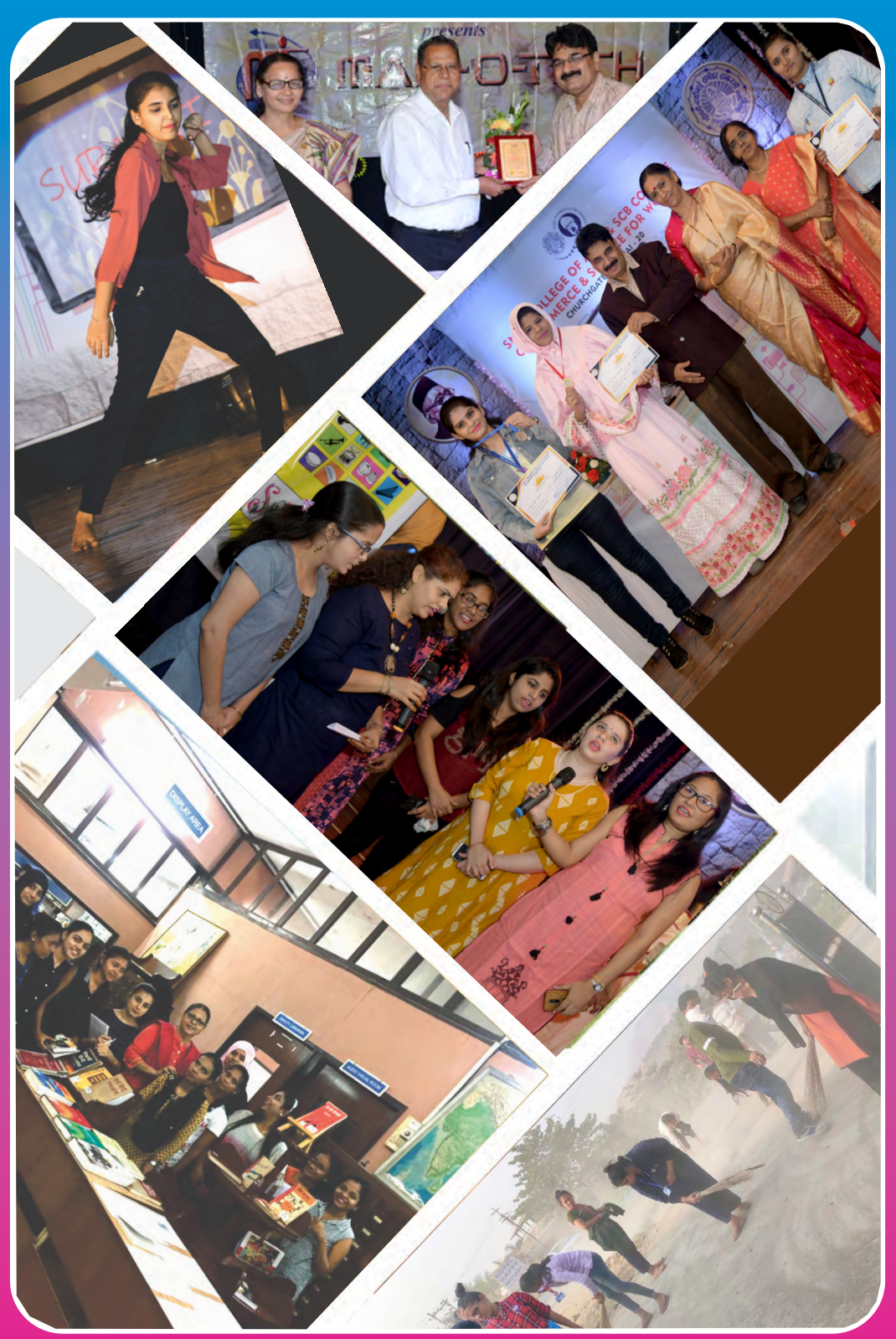
Olimpses of Activities & Events