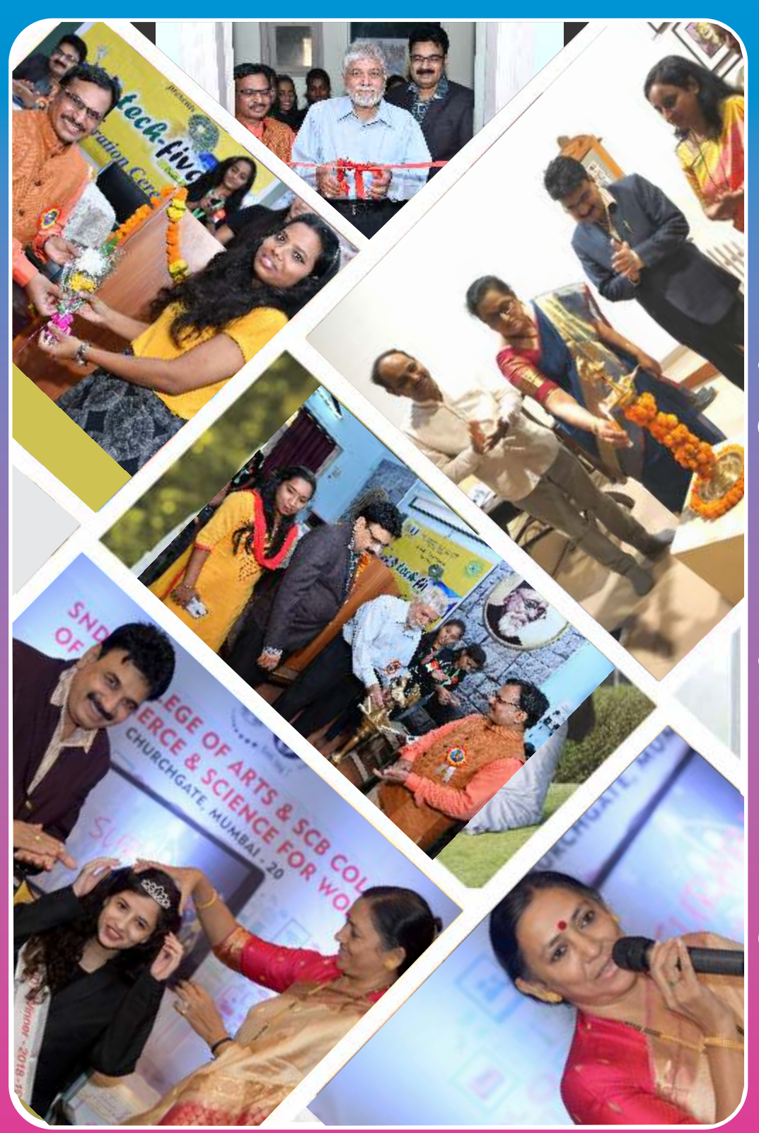
Olimpses of Activities & Events